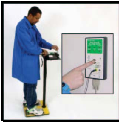
Attach wrist strap, step on dual plate and press metal button.