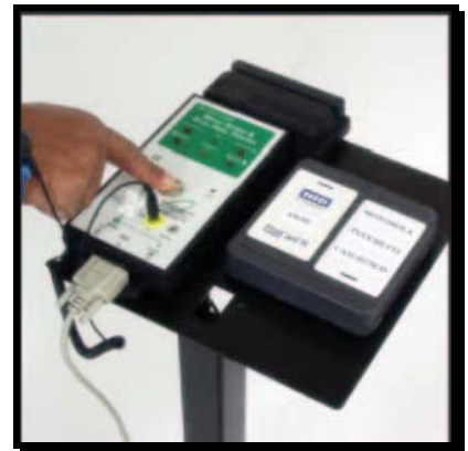
Employee passes or fails. Supervisor analyzes data and reads exception reports or email