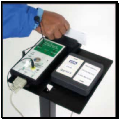
Scan using keyboard, barcode, or mag stripe, HID™, CASI-RUSCO™, MOTOROLA™, or AWID proximity reader.